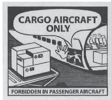
Figure 7-2. Cargo Aircraft Only label